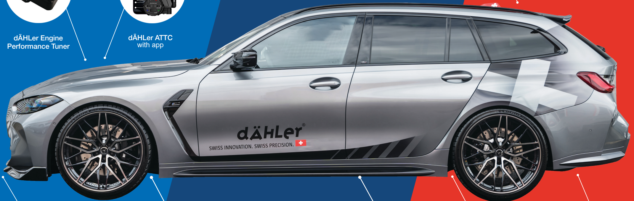
dÄHLer Decal Set