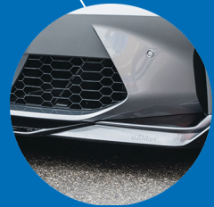
dÄHLer Full Carbon 5 Piece Front Splitter