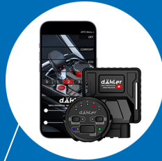
dÄHLer ATTC with app