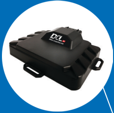
dÄHLer Engine Performance Tuner