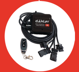
dÄHLer Valve Controller Black Edition