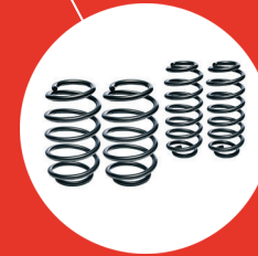
dÄHLer Lowering Springs